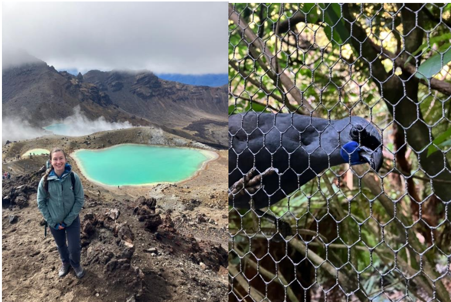
(Left) Completing the Tongariro Crossing – a 19km hike climbing up to 1900m above sea level across an active volcano. (Right) An inquisitive kokako, an endangered wattlebird endemic to New Zealand, at the Pukaha National Wildlife Centre.

Overall, I would highly recommend a placement to other students. It was inspiring to see real-world applications of research and expand my knowledge by working with different researchers. It was a welcome break to my PhD (particularly long hours of writing up) that has helped me to reset, reenergise and refocus on my future goals. It was also a great opportunity to travel, and I had plenty of time to explore New Zealand: an amazing country, especially if you like weird birds and Lord of the Rings!